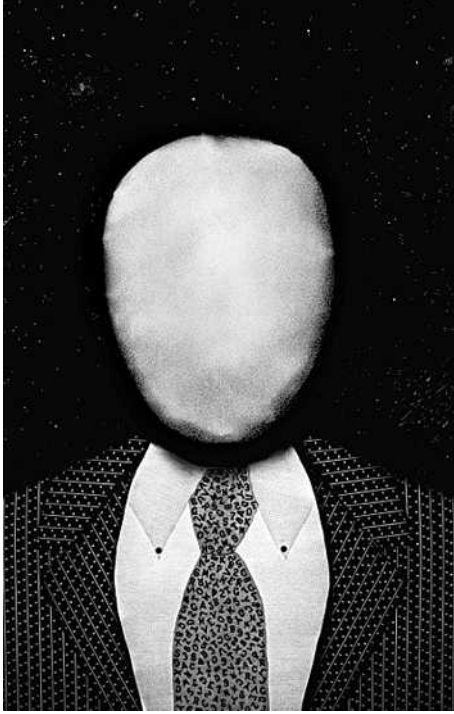
Jim Burkholder's "Man in a Suit" features a faceless bureaucrat wearing a necktie with tiny, random letters.

nifiers, none of which submits to easy interpretation.